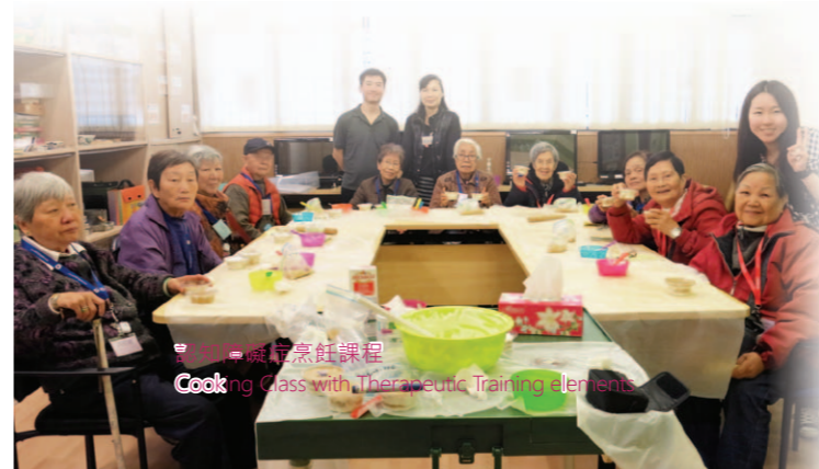
認知障礙症烹飪課程 Cooking Class with Therapeutic Training elements

此外，中心代表獲邀於「第十六屆國際認知障礙症協會亞太區學術研討會」發表演講，題目是「認知障礙症患者與照顧者日常生活記憶問卷調查報告」。