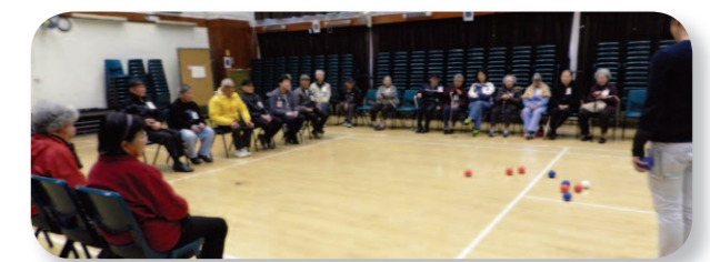
耆翠滾球運動會—透過硬地滾球運動，讓長者尋回自信，發揮團隊合作及體育精神。 Elders enjoyed playing Boccia game which could enhance their self-confidence and build up the strong relationship with others.

In addition, the Centre introduced training course of Boccia for the elders. Boccia is an internationally recognised precision ball sport designed originally for people with disabilities. After the training, a contest was run for the elders in February and March 2014. It resulted in keen competition among the participants but they enjoyed it very much.