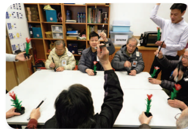
魔術組—長者齊心變、變、變，歡愉笑聲響不停。 Elders enjoyed learning magic and laughed out loudly in the class.

此外，中心今年亦為長者開設硬地滾球班，讓行動不便的長者參與國際性認可運動項目。中心更於 2 月及 3 月期間舉行會員隊際硬地滾球比賽，經過一輪激烈比賽後，誕生了冠、亞軍及得分王隊伍。