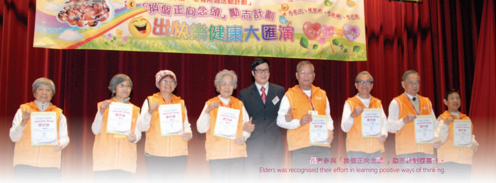
長者參與「換個正向念頭」勵志計劃獲嘉許。 Elders were recognised their effort in learning positive ways of thinking.