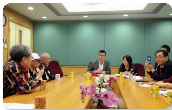
「點對點」成員與運輸署商討交通改善措施。 'Point to Point' members met officials of Transport Department to reflect their concerns.

順安長者地區中心於 2013 年成立了「點對點」長者友善發展網絡，鼓勵長者積極參與社區，為爭取長者友善措施而發聲。短短半年間，關注組在房屋署、運輸署和區議員的合作支持下，已成功爭取了 1 項社區設施及 3 項交通措施的改善，成果顯著。